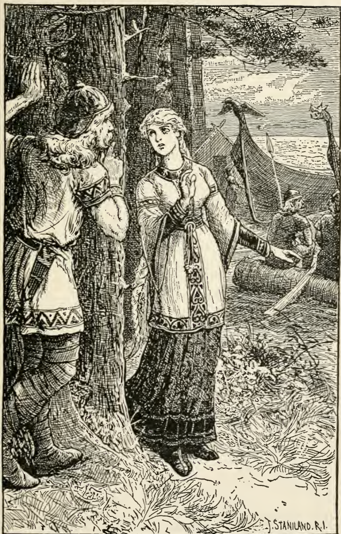
Edmund meets Freda near the camp of the Danes.—Page 270.